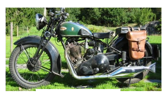
1933 BSA 600