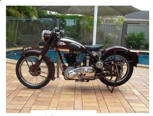
Ariel 500cc VH