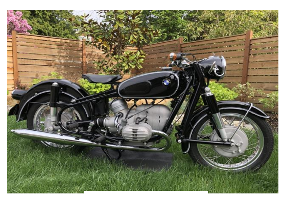
1962 R50 BMW