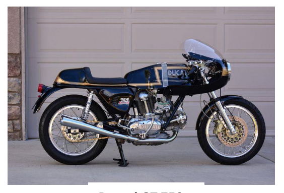
Ducati GT 750